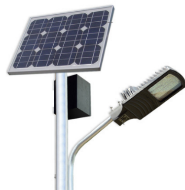
SOLAR STREET LIGHTS