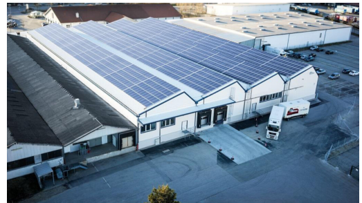
COMMERCIAL SOLAR PLANT